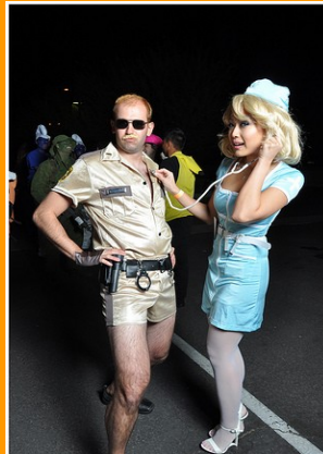
AZDA's 2009 BOO BASH www.azda.org