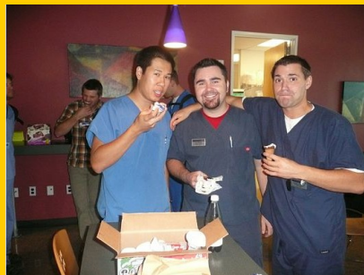
Fall Ice Cream Social 9/3