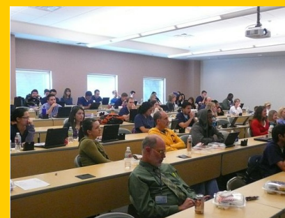
Lunch and Learn 11/19