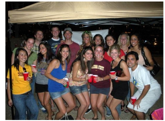
A group of D1s tailgating outside of the stadium

With good food, good company, and once the scorching sun finally went down, good weather, it's no wonder some never made it inside. Although, for those who did see the game, it was definitely a nail-biter! ASU pulled off a victory in literally the last 13 seconds! 24-17! Sorry Husky fans, maybe next year.