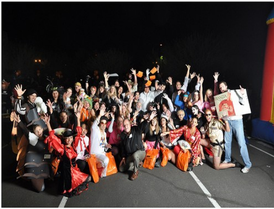
AZDA's 2009 BOO BASH www.azda.org