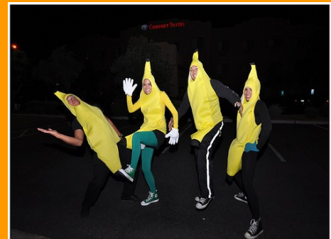
AZDA's 2009 BOO BASH www.azda.org

www.flickr.com/photos/11454503@N08/sets/72157622725609676