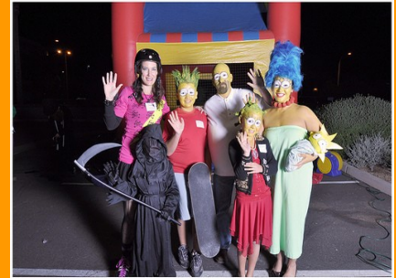
AZDA's 2009 BOO BASH www.azda.org