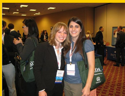
Western Regional Meeting 10/29-11/1