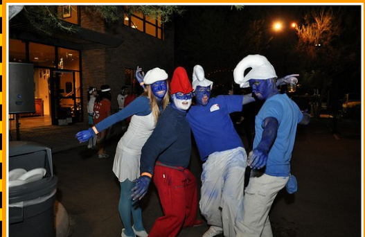
AZDA's 2009 BOO BASH www.azda.org