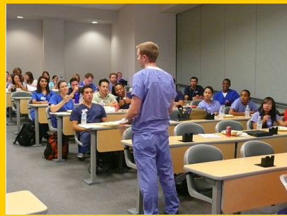
ASDA All-Chapter Meeting 9/17